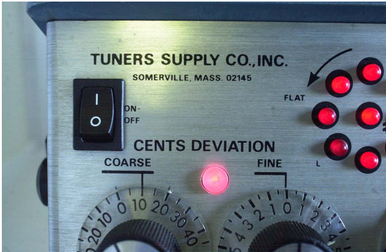
SOT II with the STRETCH button lit.

You are all set to start tuning the note C3. To start at any other note between C3 and F6, just proceed to that note with the NOTE and OCTAVE switches.